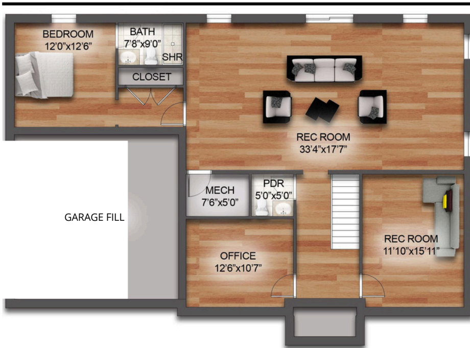
B A S E M E N T F L O O R P L A N