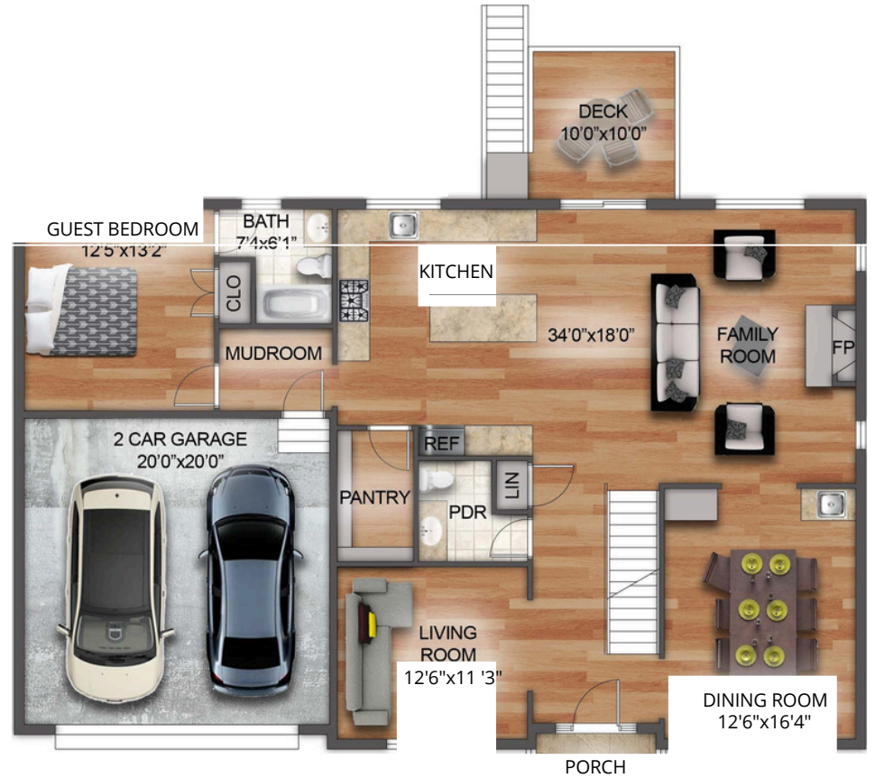
F I R S T F L O O R P L A N