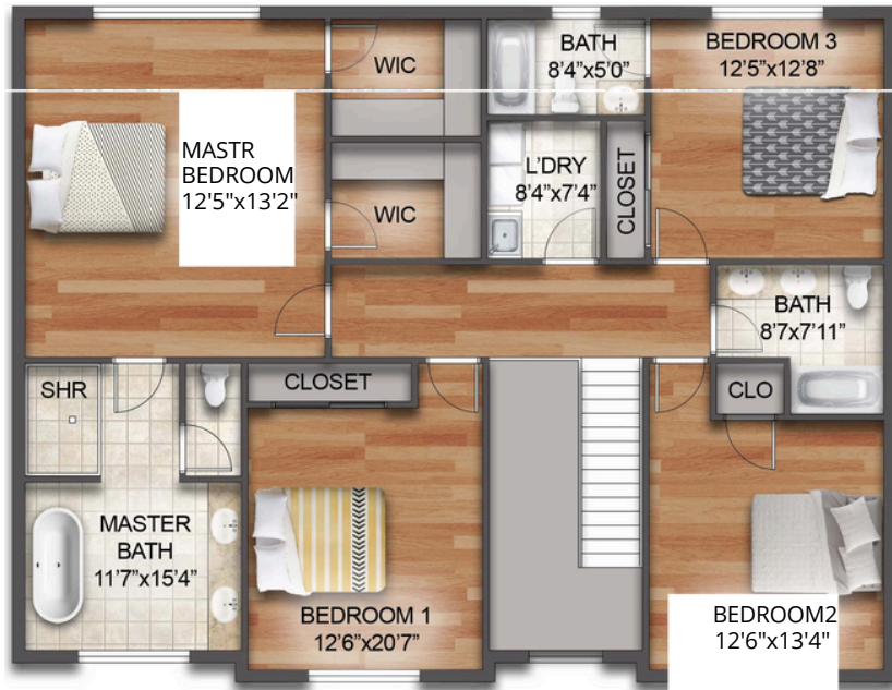
S E C O N D F L O O R P L A N