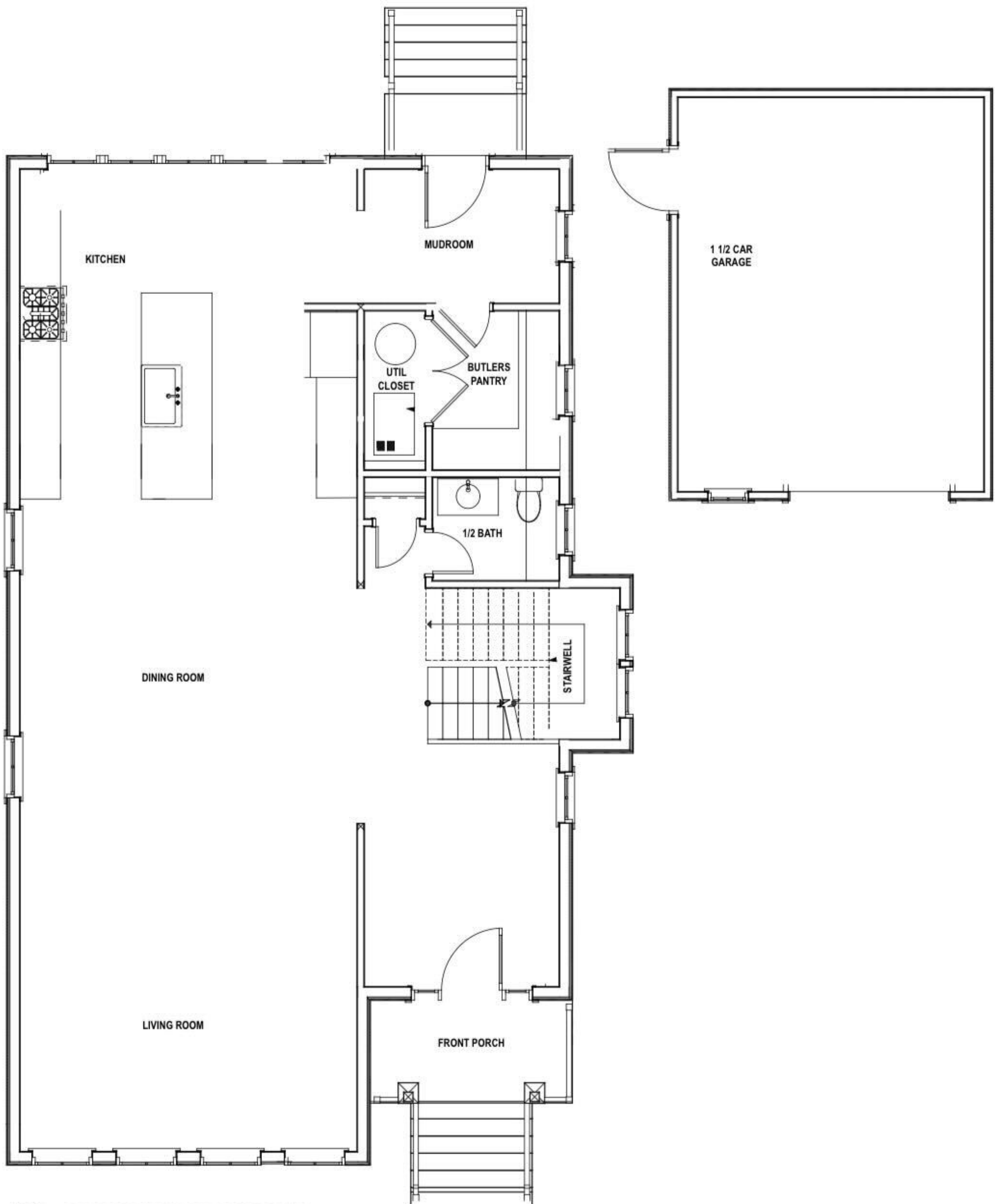
1 PROPOSED FIRST FLOOR PLAN